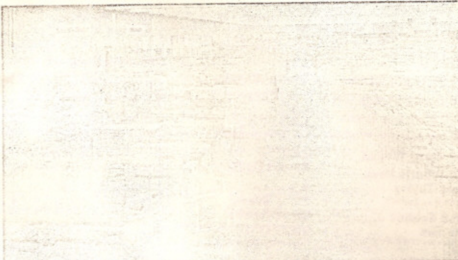
The hyper-market could mean life or death to our cities, but who knows which? This Island Now tries to find out: 9.15

† Stereophony: see page 17 ‡ BBC recording § Repeat • Approximate time